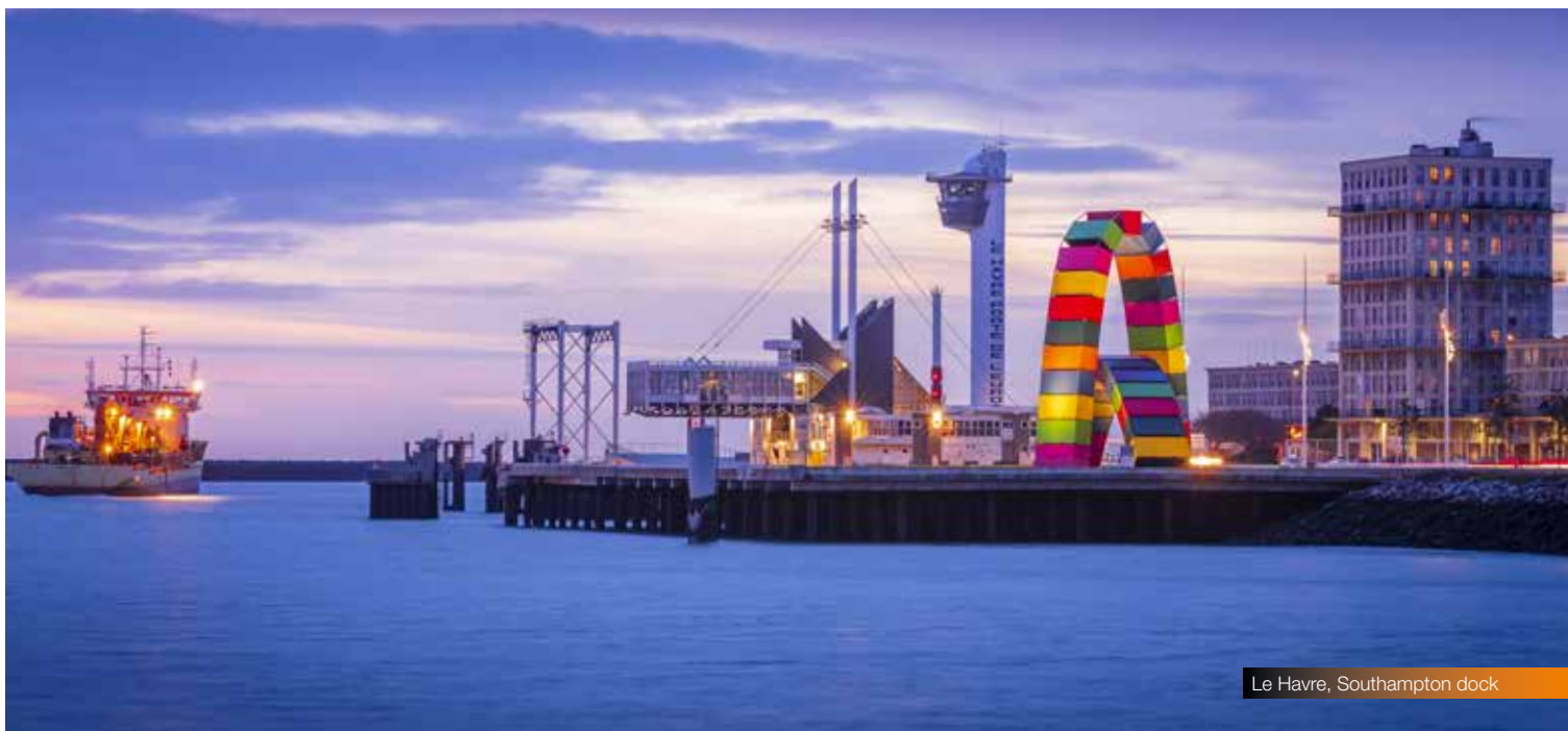
Le Havre, Southampton dock

on topics connected with the attractiveness of the local region, innovation and economic development.