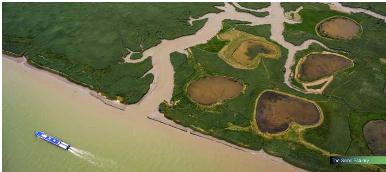
The Seine Estuary

The port of Rouen is making use of “bioremediation” to put dredged sediment to good use. The idea is to utilise bacteria, fungus and various plants capable of removing or neutralising water pollutants. Applied initially in February 2022 in the Charles-Babin dock (Saint-Gervais basin), this biological process has proven its worth: dredged sediment can now be used to fill in gravel pits.