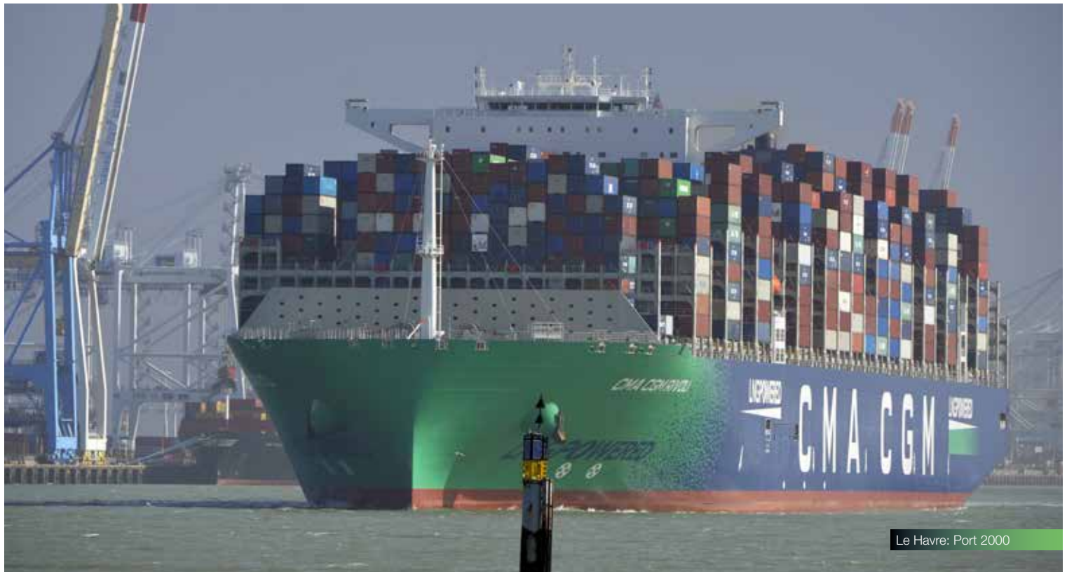
Le Havre: Port 2000

Following a call for project proposals launched by HAROPA PORT, ENGIE has set up multi-energy service stations at Limay- Porcheville and Gennevilliers which include a hydrogen production plant. Distry, a company, will itself be installing stations of this type at Bonneuil-sur-Marne, Bruyères-sur-Oise and Montereau-Fault-Yonne. These are additional to those already in place along the Seine Axis , most notably the NGV service station adjacent to the logistics parks in Le Havre's port industrial area.