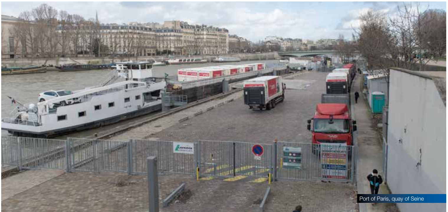
Port of Paris, quay of Seine