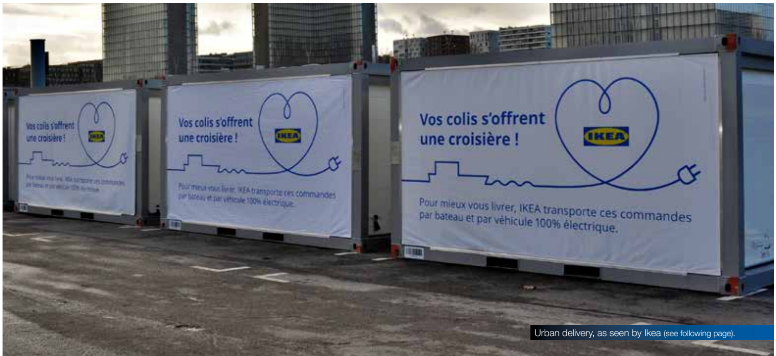
Urban delivery, as seen by Ikea (see following page).

Containers are changing to encourage shippers to use the river. Flat-rack containers without fixed side walls or roof can adapt to voluminous cargo since they can be loaded from the top or the sides. For wood, Sogestran has designed FlexiMalle, a 7-tonne capacity curtainsider structure with fold-down, removable walls.