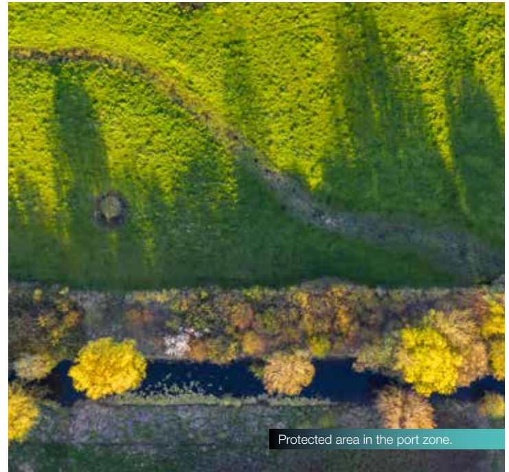
Protected area in the port zone.

HAROPA PORT is part of the World Ports Climate Actions Program – WPCAP, a voluntary undertaking by 13 international ports that, working together, wish to open the way and contribute to the building of future standards. This collective effort is an essential condition for fast, effective action. Among the priorities: quayside electrical power connections for ships at berth to improve air quality and reduce port CO 2 emissions.