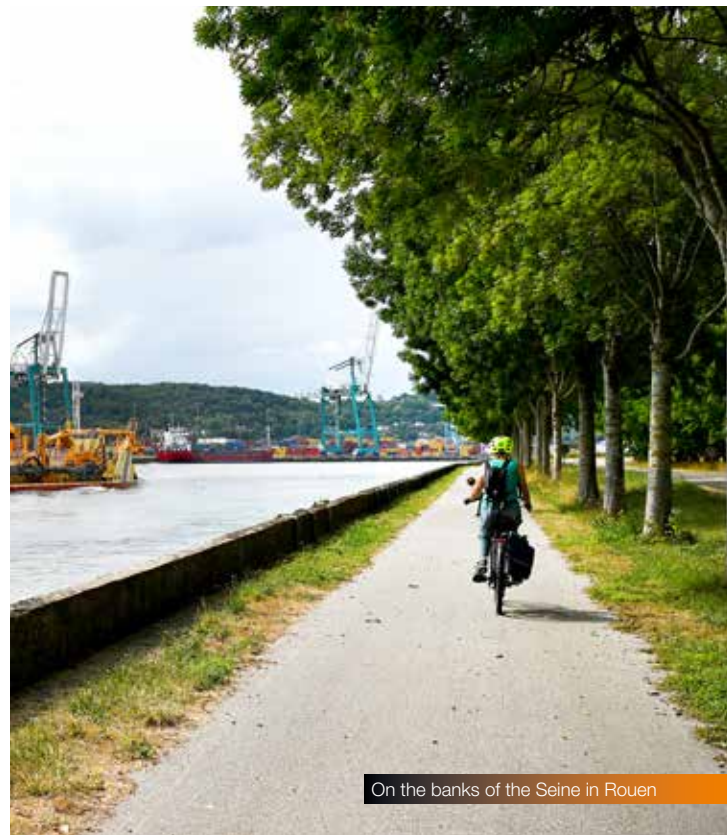
On the banks of the Seine in Rouen

Ports are often seen as closed off spaces isolated from the city and recreational and residential areas. Today, HAROPA PORT is adapting to a growing demand from wider society for mixed site uses and to allow local residents to reoccupy certain sites by associating them with local development projects .