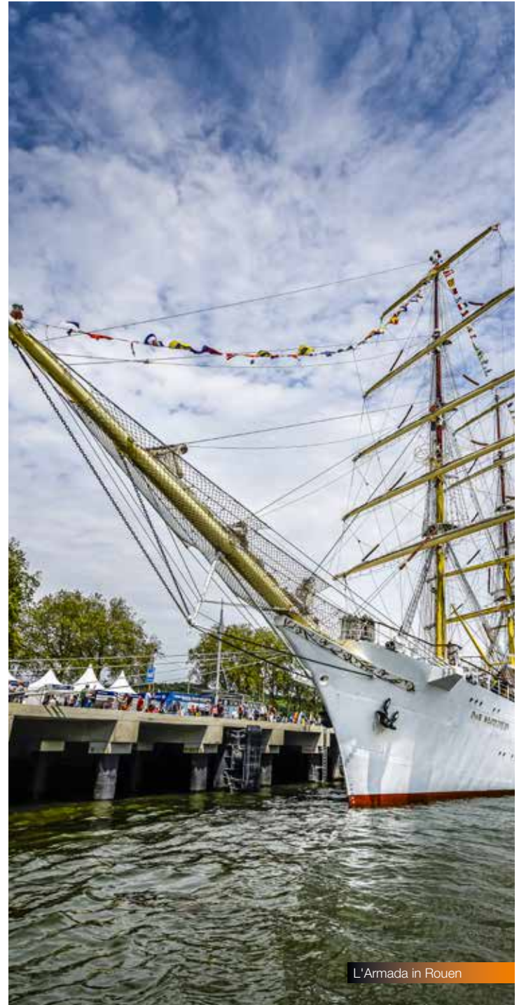
L'Armada in Rouen